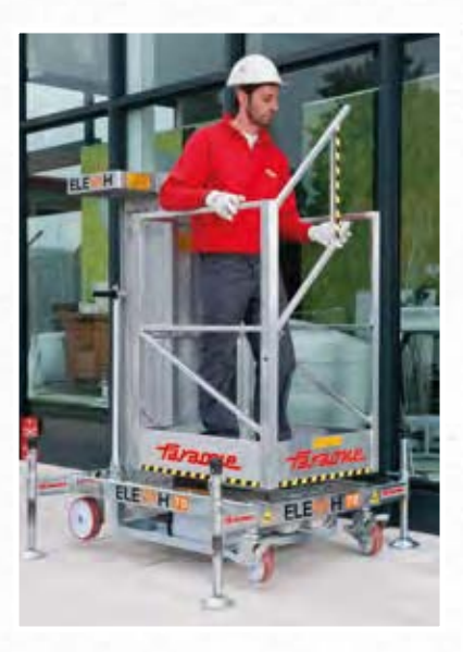
Safety is ensured during any type of work at height (maintenance, inspection, assembly, etc ...)

The Elevah 70 is the aerial platform equipped with a big basket, which has a capacity of 200 kg. It reaches 7 m working height.