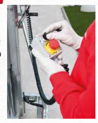
The emovable control allows the platform to be raised from the ground.